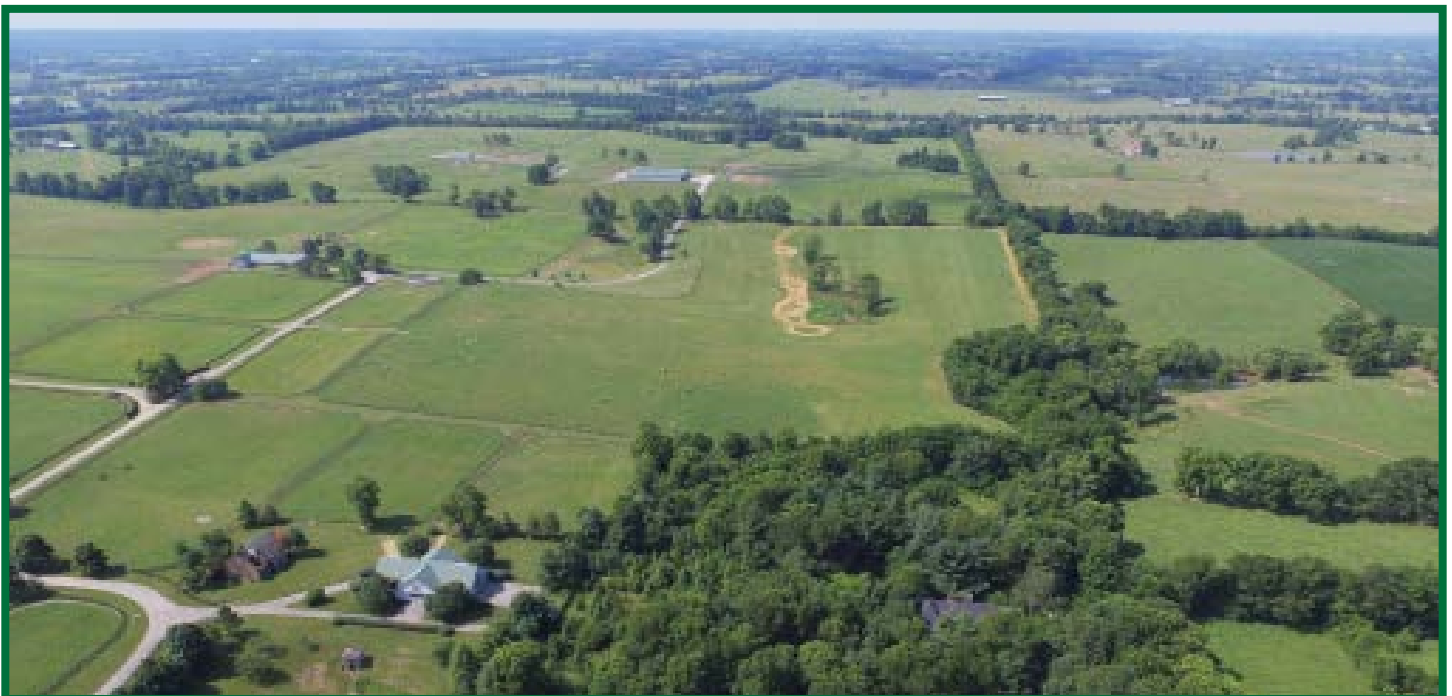
Rood & Riddle Reproduction Center

Shuttle from RREH Conference Center to the Marriott